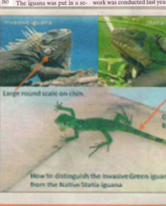
How to distinguish the Invasive Green Iguana from the Native Statia Iguana

All residents are urged to keep a close eye out for suspect iguanas in their yards or elsewhere across the island, and to report sightings to: rvanwagonveld@gmail.com , or call STENAPA at tel. 318-2884 or CNSI at tel. 318-2040.