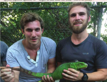
Stenapa is trying to catch as many hybrid iguanas as possible in order to prevent them from breeding.

STENAPA calls on the community to keep an eye on the iguanas, and inform the office by email or telephone when they spot a possible invasive or hybrid iguana. The local iguana is slate grey, but when young, it is intensely green. It is not to be mistaken for the invasive green iguana, which is bright green with black bands on its tail and is 700mm-500mm, or call tel. 318-5720 (cell).