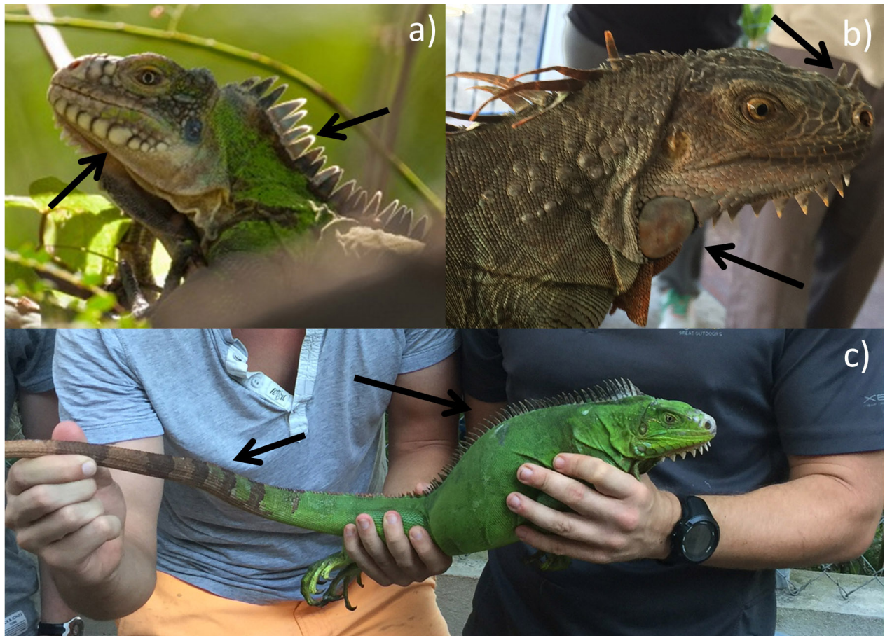
Figure 1. Key distinguishing phenotypic characteristics of a) I. delicatissima with arrows pointing to thick sub-labial scales and stout triangular dorsal spines, b) a specimen of Invasive Alien Green Iguana (specimen 2) caught prior to our Rapid Response Removal Campaign with arrows pointing at the large subtympnic scale and nasal spikes and c) a presumed F1 hybrid (specimen 7) with arrows pointing at the tempered-black tail rings and the spiky dorsal crest.

is defined as the whole period from April 2016 to January 2017. Opportunistic removals, however, continued after the campaign ended thanks to the continuing public awareness effort and broad community support. In this assessment we include information on IAGIs seen and culled both before and subsequent to our campaign, up through December 2020.