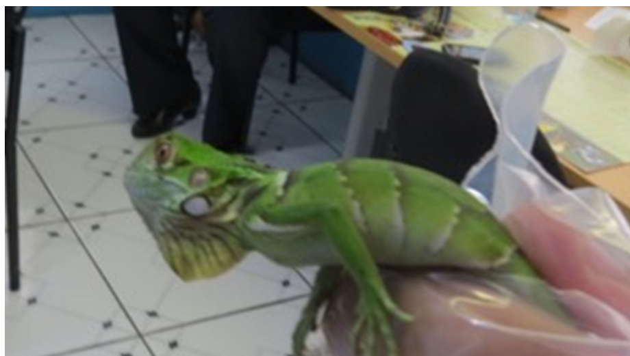
Figure 4. Juvenile Invasive Alien Green Iguana caught at the St. Eustatius harbour and euthanized by R. Hensen in 2013, exact date unknown. Photo taken at the office of the St. Eustatius Agriculture, Livestock and Fisheries Service by R. Hensen.

from the harbour area in 2013, thus documenting the first known introduction event (Figure 4). This specimen was not a direct result of our campaign but is still important to report as it provides a considerably earlier date for a first documentation of the IAGI on the island. Based on inquiries prior to our campaign, local accounts indicated that the IAGI we caught in 2016 (specimen 2) and based on which our campaign was coordinated, had been introduced as a pet but later escaped (Jesse et al. 2016). However, curiously, the specimen showed no common external signs of damage due to captivity (e.g., deformed snout and/or broken toes or nails).