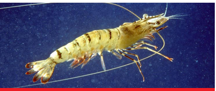
The Giant tiger prawn ( Penaeus monodon ) ( Fabricius, 1798 )

An aggressive predator in its native range (from 30°E to 155°E in longitude and from 35°N to 25°S in latitude), the giant tiger prawn has already been recorded in Mexico, Jamaica, and Trinidad and Tobago. They can grow to a larger size than native crustaceans, outcompeting them for food resources. They also carry several harmful pathogens that can be transmitted to wild crustacean populations.