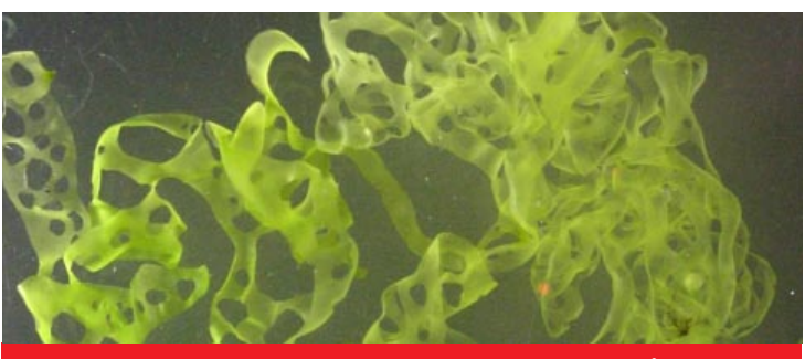
The Ribbon sea lettuce, Ulva reticulata (Forsskål, 1775)

An aggressive predator in its native range (from 30°E to 155°E in longitude and from 35°N to 25°S in latitude), the giant tiger prawn has already been recorded in Mexico, Jamaica, and Trinidad and Tobago. They can grow to a larger size than native crustaceans, outcompeting them for food resources. They also carry several harmful pathogens that can be transmitted to wild crustacean populations.