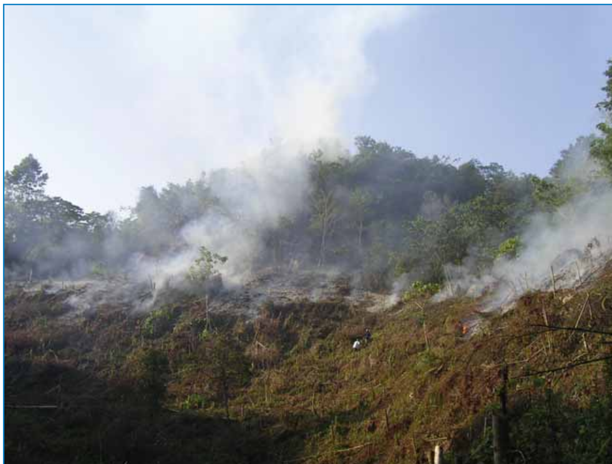
Slash-and-burn agriculture in Los Haitises IBA (DO018) is threatening the integrity of this critical ecosystem.

The protected areas of the Dominican Republic face multiple threats to the effective conservation of their biodiversity. These include uncertainties in land ownership, the lack of an appropriate system of compensation for the expropriation of land for conservation purposes, lack of clear policies for the administration and management of funds generated by protected areas, inadequate management of the areas, as well as delayed local development as a result of centralized policies. Knowledge of regulations and permitted uses of the protected areas is lacking, as is a general awareness of their importance, value and the ecological services they provide. Together with imprecise boundaries, these deficiencies lead to disturbances such as expansion of agricultural activities (including cattle grazing), as well as forest fires, deforestation, illegal hunting, fishing, and trafficking of endangered species. Other threats relate to the expansion of unsustainable tourism, mining, and hydro-electric projects. Finally, poverty levels in communities adjacent to the parks have led to unsustainable land-use practices and illegal human settlement both within the protected areas and their buffer zones. The threats faced by the nation's protected areas (many of which are IBAs) are indicative of what is happening to biodiversity across the country.