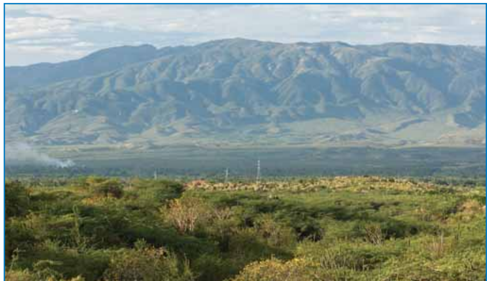
Sierra Martín García IBA (DO010) —a poorly studied area in need of conservation action.

Hispaniola is considered to have the highest biodiversity in the Caribbean, distributed across an intricate mosaic of environments and microclimates that have formed as a result of a complex geological history. This has produced sites which range from 40 m below sea level (e.g. Hoya de Enriquillo), to those at more than 3000 m (within the