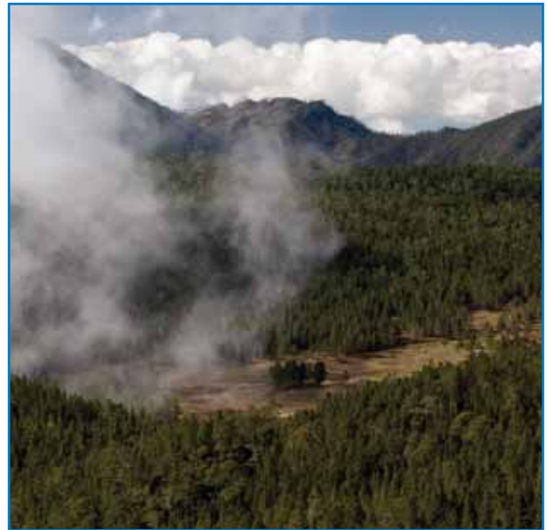
Valle Nuevo (DO011) is one of 11 sites monitored for threats (“Pressure”), condition (“State”) and conservation actions at IBAs (“Response”).

Continuity has also been provided for key components of the IBA program due to coordinated activities among different projects, favoring activities such as monitoring, celebration of key dates in the environmental calendar (e.g. World Bird Festival), threatened species conservation, strengthening of the Local Conservation Group Networks and improvements to local livelihoods. These activities have helped create awareness of the IBA concept and maintained enthusiasm and interest among the general public. They have also assisted the adoption of the IBA conservation model among government authorities.