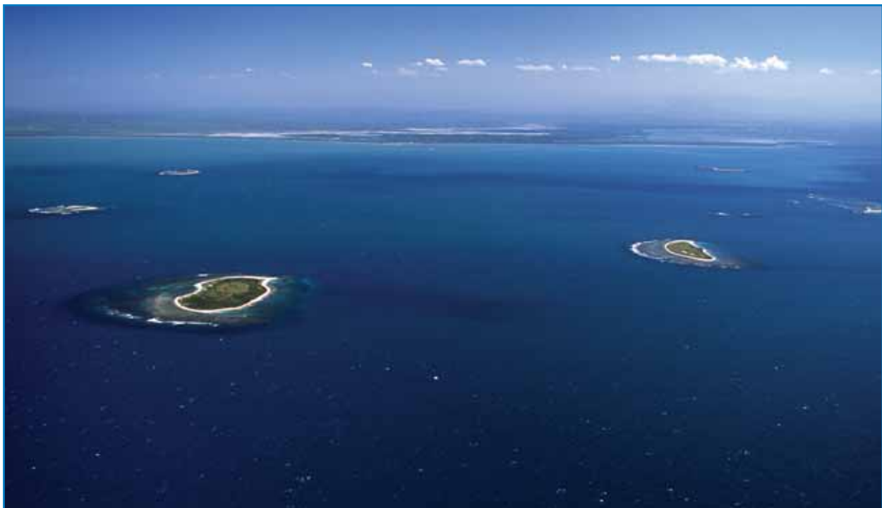
Cayos Siete Hermanos (DO001) supports globally significant numbers of breeding seabirds.

The Dominican Republic is also important for large breeding and wintering populations of waterbirds and seabirds. Laguna Limón (DO019) and Laguna Cabral (DO008) support the largest reported population of the Near Threatened Caribbean Coot ( Fulica caribaea ), with up to 6000 and 3000 individuals, respectively. Laguna Cabral is also home to some of the largest wintering concentrations of ducks in the Caribbean with up to 160,000 individuals (of various species) reported. Seabirds are primarily concentrated on the satellite islands around the Dominican Republic's coast. They are relatively poorly known in terms of colony status and size, but the Sooty Tern ( Sterna fuscata ) colony (of 80,000 pairs) on Isla Alto Velo is one of the largest in the Caribbean. Monitoring of the other known breeding islands would provide valuable information that may result in new IBAs being defined.