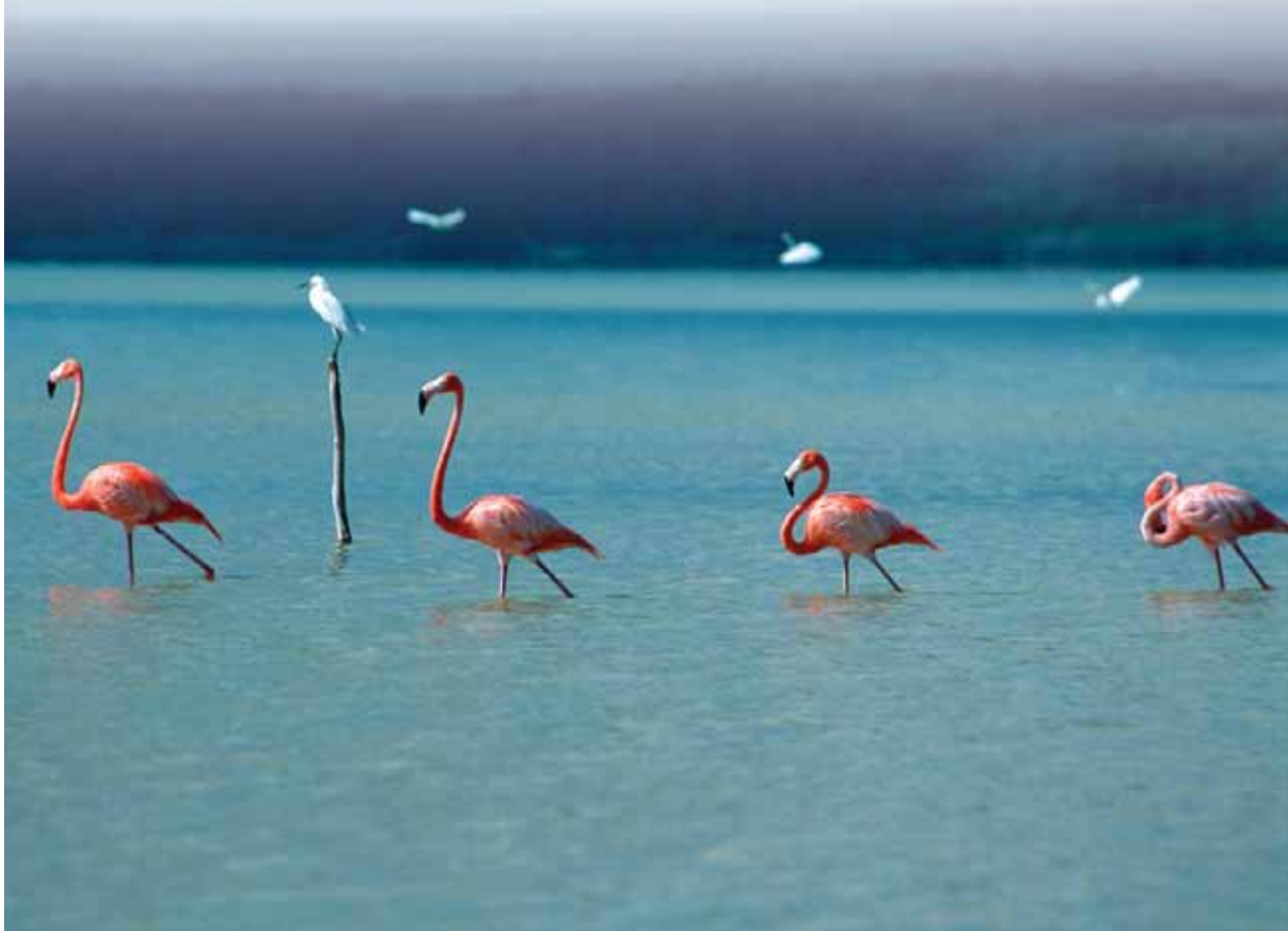
Flamencos at Laguna Oviedo (DO007).

majority of the country's life zones, habitats and vegetative associations are represented within the IBA network. Some of the IBAs are recognized under other international designations, such as the Lago Enriquillo Ramsar Site, the Jaragua-Bahoruco-Enriquillo Biosphere Reserve, and Los Haitises and Sierra de Bahoruco as Alliance for Zero Extinction (AZE) sites.