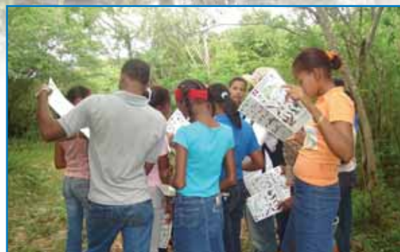
Local Conservation Group at Fondo Paradí.

The IBA Parque Nacional Jaragua (DO007) is located in the south-western corner of the Dominican Republic, on the Barahona peninsula. The IBA is globally important for threatened, range-restricted and congregatory bird species, as well as other endemic and threatened flora and fauna, including the Critically Endangered Dominican cherry palm ( Pseudophoenix ekmanii ) and Ricord's iguana ( Cyclura ricordi ). Two projects to engage communities in sustainable use initiatives were implemented by Grupo Jaragua (BirdLife in Dominican Republic) at Laguna Oviedo (a 27 km 2 coastal salt pond within the park), and at Fondo Paradí within the buffer zone. The projects aimed to contribute to the long-term conservation of bird habitats and their sustainable use. At Laguna Oviedo, infrastructure was constructed by the Ministry of the Environment and the Spanish Cooperation Agency as part of the project, including signage, a visitor center and observation tower to support sustainable activities for approximately 2000 tourists per year. Capacity building continues for local eco-guides to improve the quality of ecotourism services at Laguna de Oviedo. At Fondo Paradí, local community and Site Support Group members have participated as field guides, field work