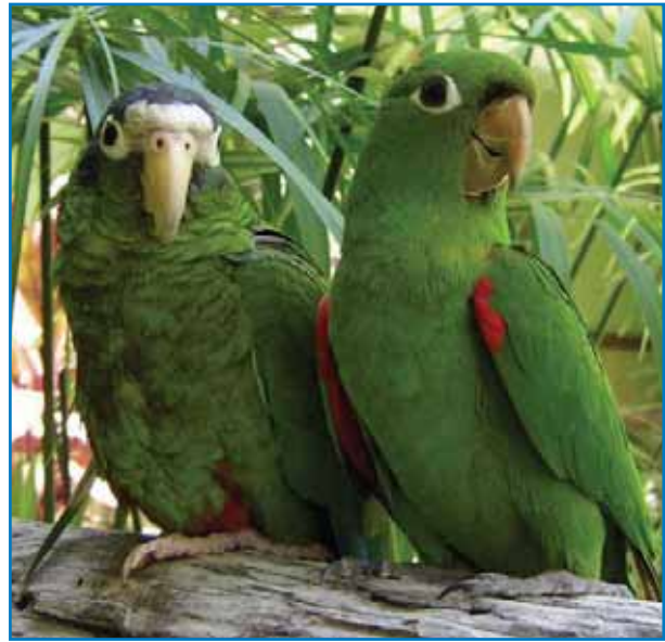
The Vulnerable Hispaniolan Amazon ( Amazona ventralis ) and Hispaniolan Parakeet ( Aratinga chloroptera ) are both captured for the illegal pet trade.

There are records of 23 threatened or Near Threatened species in the Dominican Republic, including one Critically Endangered, four Endangered, nine Vulnerable, and nine Near Threatened species. However, three of the Near Threatened species are not represented in IBAs since they are not considered to sustain significant populations in the country, namely Back Rail ( Laterallus jamaicensis ), Piping Plover ( Charadrius melodus ) and Golden-winged Warbler ( Vermivora chrysoptera ). The Critically Endangered Ridgway's Hawk ( Buteo ridgwayi ) is now confined to Los Haitises (DO018) where the small population is declining. The Endangered Black-capped Petrel ( Pterodroma hasitata ) maintains a small breeding colony in the Sierra de Bahoruco (DO006), and this IBA also supports critical populations of the other Endangered species, namely Hispaniolan Crossbill ( Loxia megalaga ), La Selle Thrush ( Turdus swalesi ) and Bay-breasted Cuckoo ( Coccyzus rufigularis ). Many of the globally threatened birds are restricted to the high altitude broadleaf and pine forests.