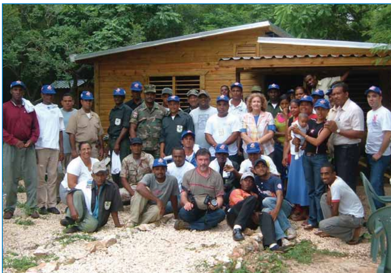
Jaragua Community Volunteers and other local stakeholders have played a vital role in IBA monitoring and educational activities at Laguna Oviedo within Jaragua National Park (DO007).

For information on trigger species at each IBA, see individual site accounts at BirdLife's Data Zone: www.birdlife.org/datazone/sites/