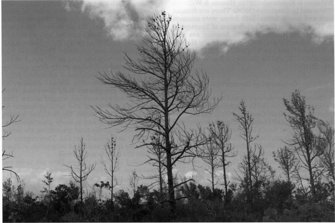
Fig. 2. Caribbean pine trees on North Caicos, Turks and Caicos Islands—trees killed by pine tortoise scale.

(Kairo et al. 2000). Yet despite the potential environmental and agricultural importance of invasive scale insects they have hardly been studied in many Caribbean countries.