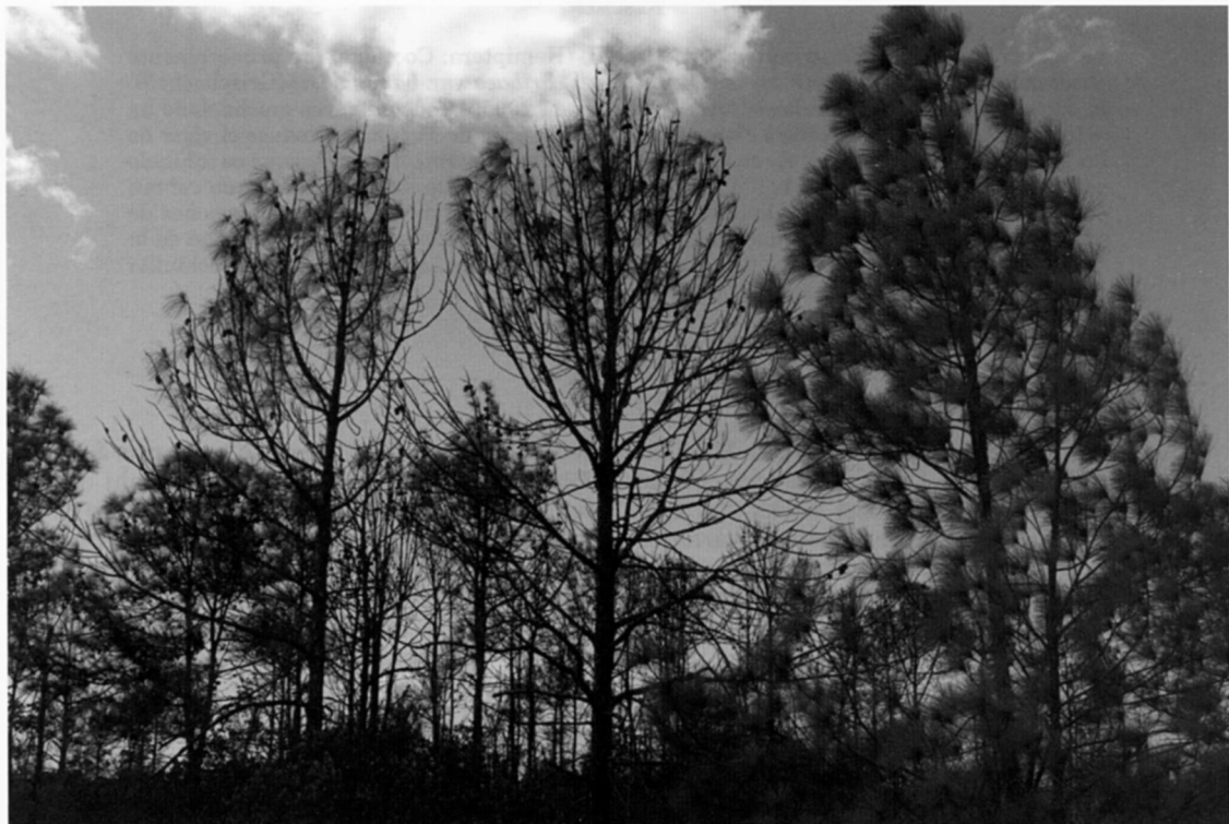
Fig. 1. Caribbean pine trees on North Caicos, Turks and Caicos Islands—range of damage caused by pine tortoise scale.