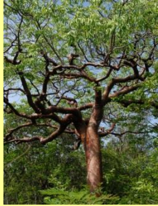
Gumbo Limbo/ Gum Elemi

Have you ever heard of Gumbo Limbo, Horseflesh or Strong Back? What about Gale of Wind, Goat's Foot or Sea Oxeye? These are some of the many native plants found in The Bahamas.