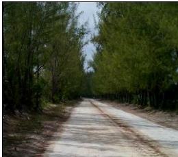
Casuarinas grow quickly on cleared land

While non-native plants may benefit us in some ways, some of them can be harmful. Invasive plants are non-native plants that cause harm to ecosystems, the economy or human health. They grow quickly, spread rapidly and are usually the first to grow when