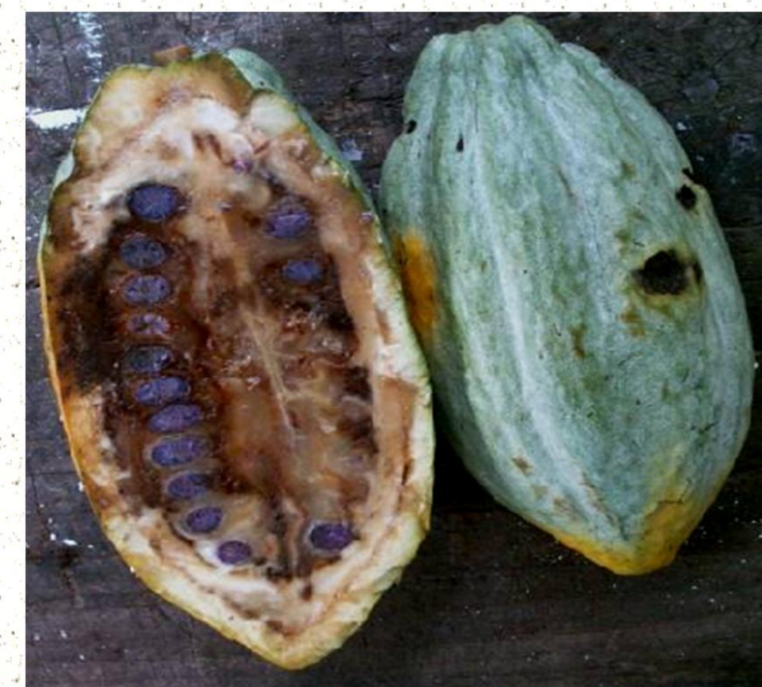
Figure 2. Pod showing extensive internal pod rot and breakdown of seeds due to Moniliophthora roreri .