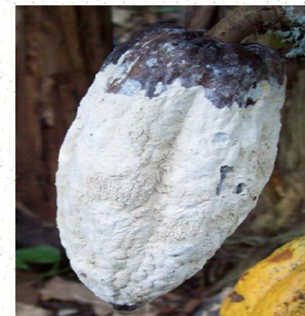
Figure 3. Pod covered with external fungal growth of Moniliophthora roreri .