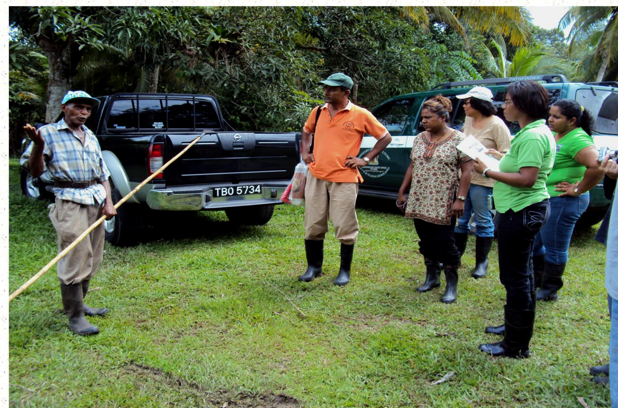
Figure 4. Survey personnel interviewing cocoa farmer in Biche, Trinidad