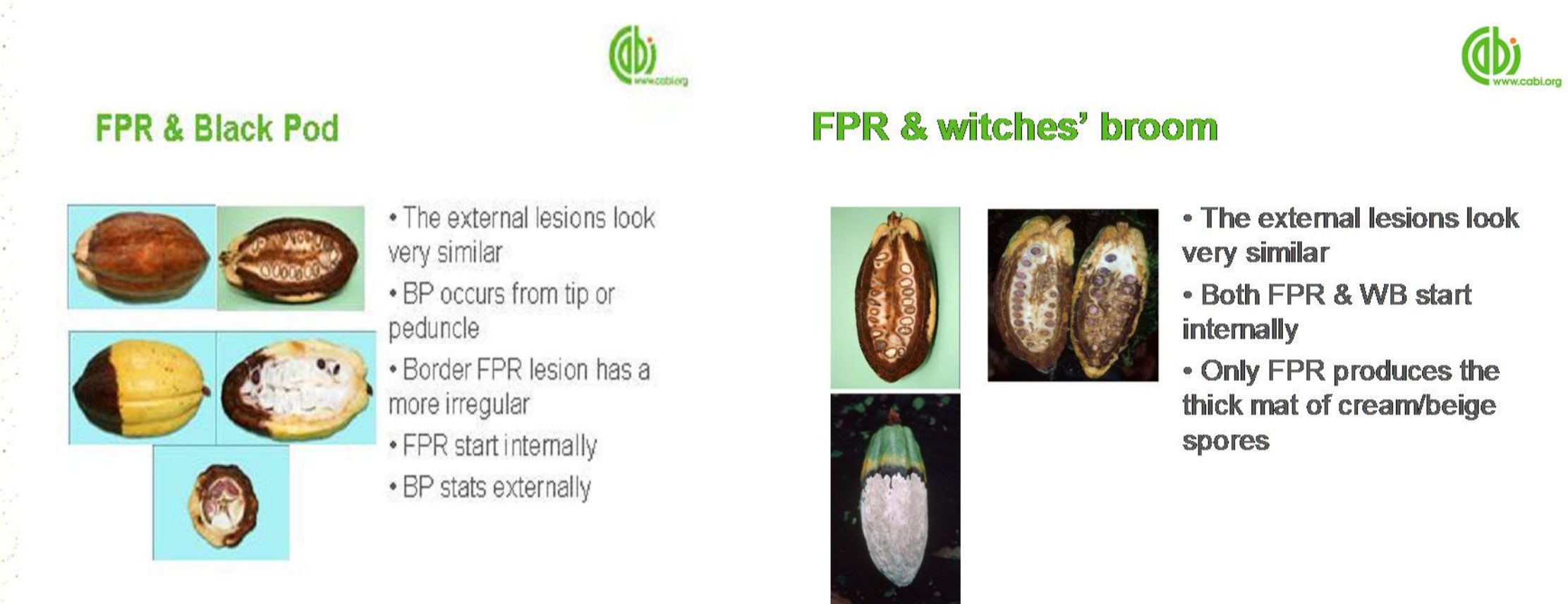
Figure 5: Plates showing differences between FPR, Black Pod and Witches broom