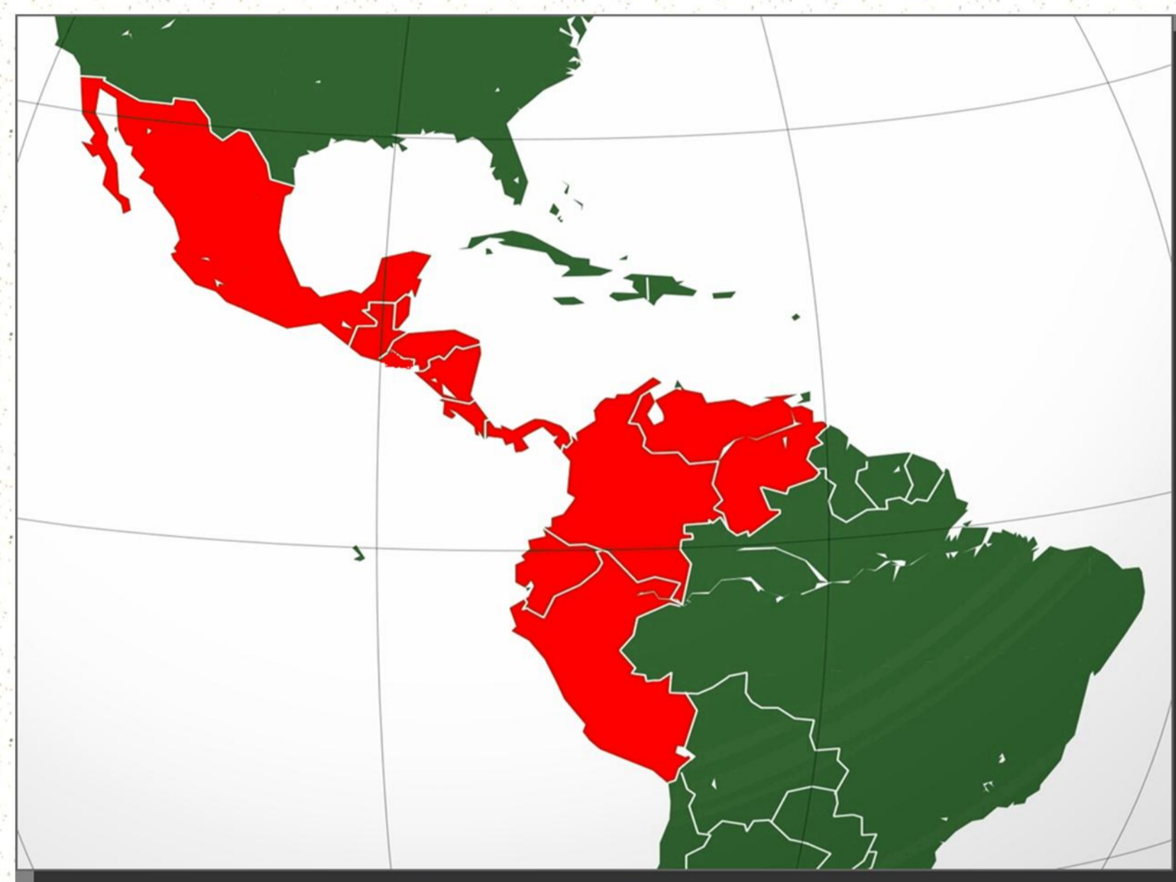
Figure 1. Map showing distribution of frosty pod rot (infected areas shown in red).

At present the disease is in Central and South America and in particular the western part of neighbouring Venezuela and continues to spread rapidly in this part of the world (Fig. 1).