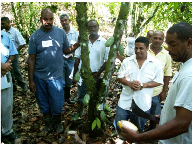
Field training on handling of cocoa pods and recognition of diseases associated with cocoa.