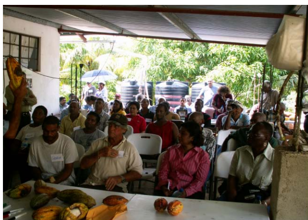
Cocoa farmers at a Cocoa Training Field day in Moruga, information being shared on frosty pod disease of cocoa (December 2009).