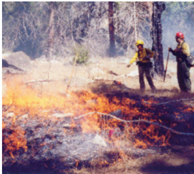
Prescribed burns can be counterproductive. The National Park Service temporarily suspended prescribed burns in lower elevation yellow pine forests of the southern Sierra Nevada because the burn prescription being used aided invasion by cheatgrass ( Bromus tectorum).