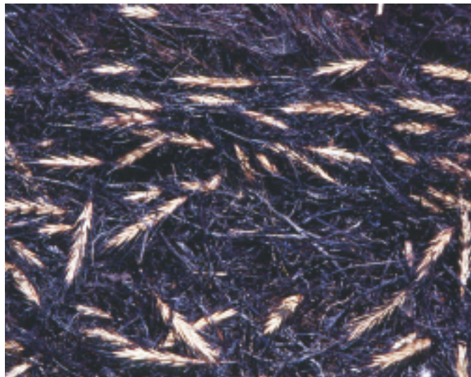
Timing is key to controlling plants and seeds. Though they appear intact, these medusahead seedheads from the canopy have been killed by the heat of a prescribed burn. This study by UC Davis found that burning before seed dehiscence is one of the most effective controls for medusahead in California's Central Valley region. Bobcat Ranch, Yolo County, California, June, 2003.

Herbaceous perennial grasses and forbs survive for more than two years. They are more difficult to control with fire than invasive annuals. This is particularly true for perennial forbs, for which there are few examples where fire alone has proven suc-