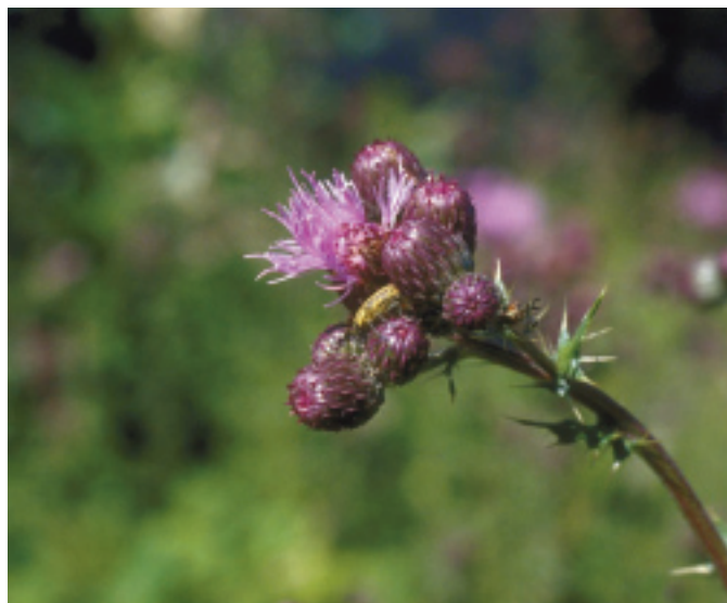
Fire can enhance effectiveness of insect biocontrol agents. Larinus planus (Fabricius), the Canada thistle bud weevil, is shown on Canada thistle ( Cirsium arvense ).

Disturbance regimes affect ecosystem properties such as rates of soil erosion and formation, and