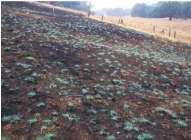
Native plant communities can regenerate after fire. Meadow barley ( Hordeum brachyantherum ) resprouting in early Spring, 1998 following a prescribed burn the summer before to control barb goatgrass. Two years of burning was found to provide good control of barb goatgrass. Hopland Research and Extension Center, Mendocino County, California.

A clear distinction must also be made regarding the effects of a single fire versus the effects of a repeated pattern of burning over time, otherwise called a fire regime. Single fires can display significant temporal and spatial variability, as described. This variability is compounded in fire regimes involving multiple fires over time. Fire regimes can vary in the type, frequency, intensity, extent and spatial pattern,