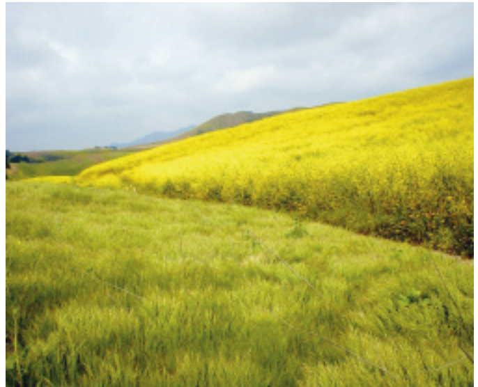
Burns may clear one weed and stimulate another. A burn was conducted to control ripgut brome ( Bromus diandrus ), which remains dominant in the unburned foreground. Beyond the firebreak, a nonnative forb, black mustard ( Brassica nigra ), has taken over after the grassland burned.

Most often a single method is not effective in the sustainable control of a range weed. A successful long-term management program should be designed to include combinations of mechanical, cultural, biological, and chemical control techniques (DiTomaso 2000). Integrated approaches for weed management have not been well studied. This is true with or without the incorporation of prescribed burning. Innovative land managers have successfully used integrated strategies to control many different species. However, these reports occur mostly as anecdotal stories and do not appear in the literature. A greater exchange of information is needed in all areas related to the use of integrated weed management in rangelands and wildlands.