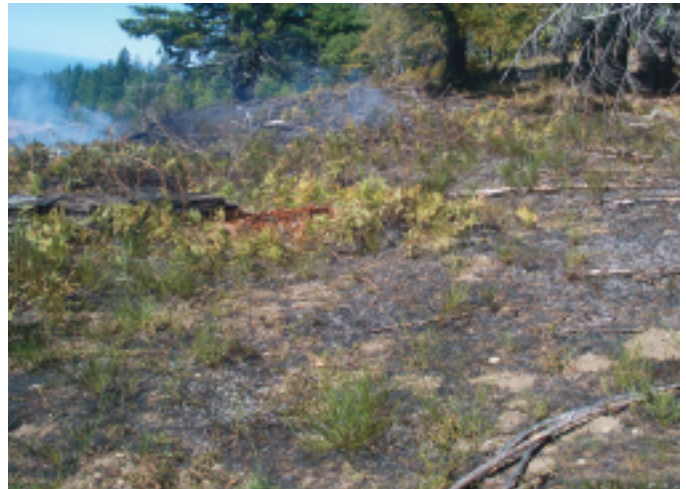
Fuel loads, site and weather conditions affect burns. This patchy burn in the Bald Hills of Redwood National and State Parks in California reduced cover of Scotch broom and stimulated the soil seed bank, but left significant areas unburned.

Probably the biggest gap in our understanding of the ecosystem effects of prescribed burning is the impact it has on native vegetation. Only a few perennial grasses and legumes species have been studied in any detail. There is much to know on the effects of burning on other native and non-native species, both short and long-term responses to single fire events or repeated burning. It is particularly important to understand the impact of burning on threatened and endangered plant species. Understanding their response to fire can assist in the decision making process on managing invasive species.