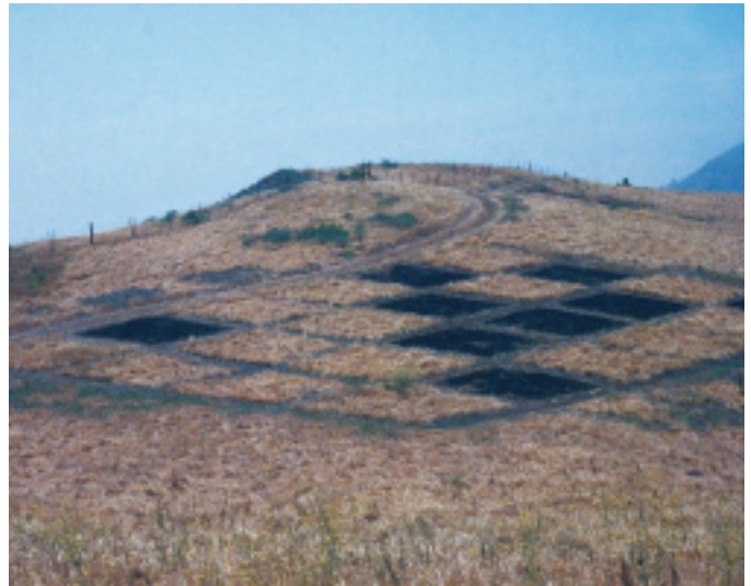
Experimental studies examine ecological effects of fire. On Santa Cruz Island, CA, The Nature Conservancy used patchwork blocks to test how site topography and orientation, as well as burn frequency and seasonality, affect resulting plant community composition and structure. Data was collected before burning and for four years after burning. Results were complex, but in all cases non-native grasses regained dominance when burning stopped.

Many studies describing the effects of fire on vegetation have been conducted after fires have occurred (i.e. post-hoc studies), where there was little or no information on the characteristics of the fire being studied. In many other cases where fire is applied as part of an experiment, the characteristics of fire are described in general terms, or summary values are presented describing the average characteristics of variables such as rate of spread, flame