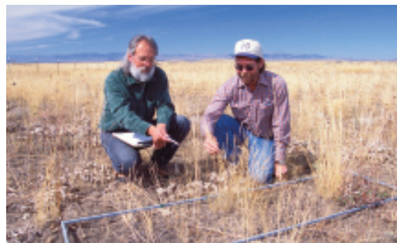
Post-burn monitoring documents changes to plant community. US Department of Agriculture rangeland scientists measure regrowth after a burn.