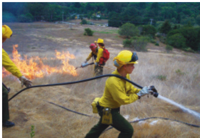
Containment strategies are implemented before a burn. Control lines around the edge of the burn unit can be set by wet-lining with water and foam.

The cost of training, especially for classes outside of the employee’s organization, can be high. Training for a desired function often requires prerequisite training and experience. Often knowledge and ex-