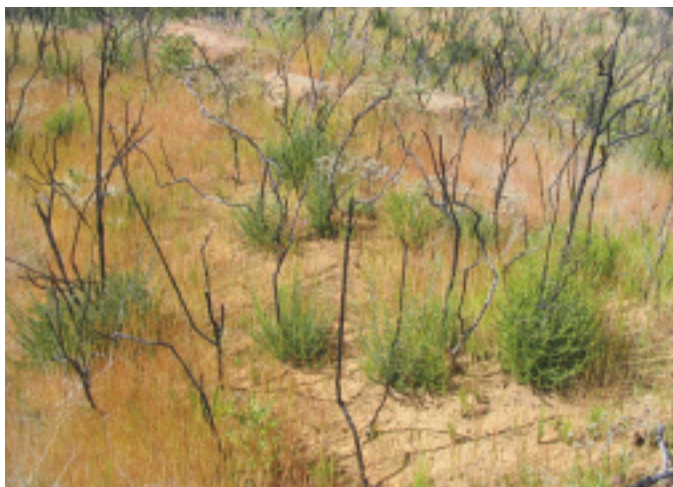
Some species resprout after fire. Fire-adapted woody species, like the native chaparral shrub chamise ( Adenostoma fasciculatum ), can resprout from the base following a burn. Invasive woody species like broom can also resprout. McLaughlin Reserve in the northern Coast Range of California, Spring, 2005.

In eastern and mid-Atlantic states, prescribed burning for woody invasive plant control is conducted during the dormant season, but it is generally unsuccessful because of profuse resprouting from the rootstocks. It is likely that growing season burns would be more effective since non-structural carbohydrate reserves are lowest at this time (Richburg et al. 2001, Richburg and Patterson 2003). This would potentially deplete the energy reserves of the plants root system, making it more susceptible to subsequent burns or other control options.