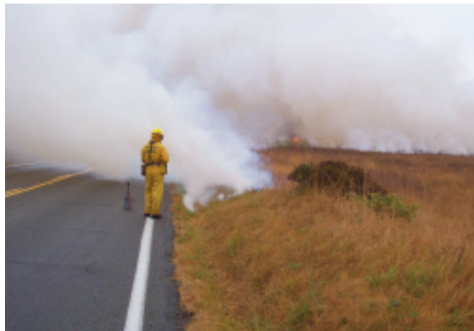
Air quality and road closures are major public concerns. Smoke does not disperse well when a high-pressure system keeps hot air at the surface. This burn at Point Reyes National Seashore was shut down because stable atmospheric conditions did not change.

To overcome these obstacles and proceed with the project, the lead agency must provide as much information and education as possible for the cooperators, neighbors and community. This is best achieved by encouraging participation in the planning process and accepting comments from interested individuals. Concerns need to be addressed and, as necessary, mitigated. Urban dwellers generally have less inclination to support projects involving burning, mostly due to the potential impacts of smoke and property damage. People in rural areas, especially those allied