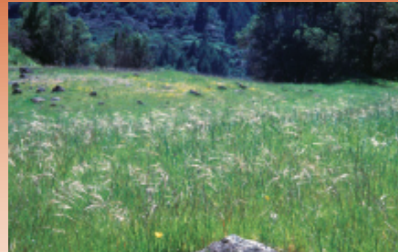
Purple needlegrass ( Nassella pulchra ) and other native plants increased greatly in abundance following consecutive prescribed burns for control of yellow starthistle at Sugarloaf Ridge State Park, Sonoma County, CA.

Much of what we currently know about using fire to manage vegetation—and to control invasive plant species in particular—has been derived from studies of cropland systems. However, there are many fundamental differences between cropland and wildland settings, and our ability to use effects observed in croplands to predict effects that may occur in wildlands is limited. Some of these fundamental differences include the timing of fires, fuel