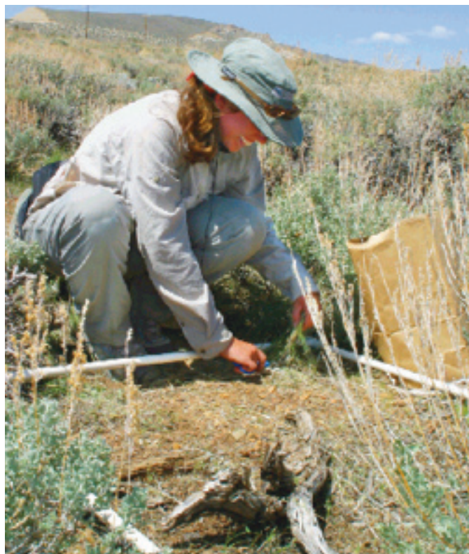
Fuels impact fire characteristics. Before test burns, US Geological Survey staff collect biomass to assess fuel loads and fuel moisture. Mono Lake, CA.

Late spring or early summer burning has been shown to have a more pronounced positive effect on forb species, both native and non-native (DiTomaso et al. 1999). Three consecutive years of prescribed burning increased native forb cover in spring by nearly 400% in Sonoma County, boosting the native proportion of total forbs from 17% live canopy to 67% (DiTomaso et al. 1999). A number of individual