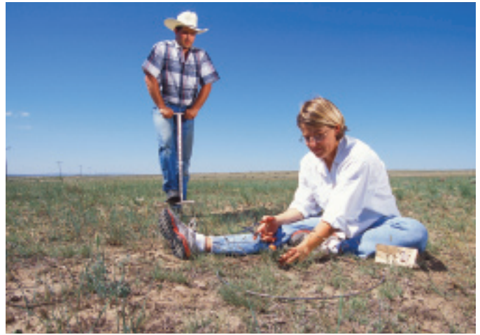
Soil samples and vegetation reflect changes. Measurements before and after burns can document changes to soil nutrients, plant productivity, and other parameters.

On the other hand, chaparral is a fire-adapted shrubland that sometimes has extremely high surface temperatures of 700°C. Although the vegetation may be totally consumed, the impacts on soil N are mixed, with most fires showing increases or no change in mineral N (decreases occur primarily through erosion), and others showing decreases or no change in total N (Table 3, Neary et al. 1999, DeBano et al. 1998). Consumption of the vegetation means that a large fraction of total ecosystem N has been lost, but studies have shown the capacity of chaparral to recover its N capital during succession. Available N in fact declined during 80 years of succession following fire in chaparral, indicating the role of fire to release immobilized N and stimulate plant growth (Fenn et al. 1993). In addition, the early years of succession in chaparral are characterized by high colonization of the N-fixing leguminous shrub Lotus scoparius , which declines after only 5-7 years. Other sites have persistent