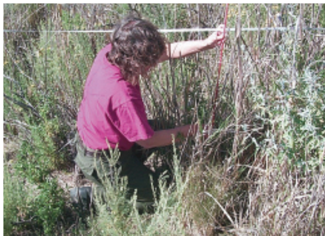
Post-burn monitoring establishes each fire’s impact. By recording species and other vegetation characteristics in burn plots, long-term trends can be established, allowing resource managers to determine whether or not prescribed fire objectives are being met. At Point Reyes National Seashore, vegetation data is collected pre-burn, and at one, two, five, and ten years after the fire.

The effect of fire on individual plants depends on the degree to which perennating (surviving) tissues are protected from lethal temperatures (Whelan 1995). Raunkiaer (1934) developed a life form classification system that groups plants into categories based on the exposure of the perennating tissue to stressful growing conditions caused by summer drought or winter cold. This system is roughly based on the vertical positioning of the perennating tissue above or below the soil surface, which generally corresponds to areas of relatively high and low temperatures during fires (e.g. Brooks