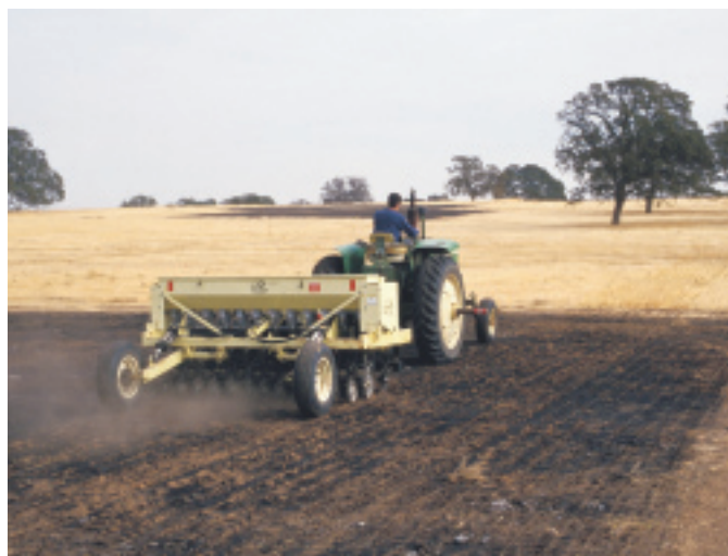
Post-burn seeding can play a role. As part of an integrated management study for control of medusahead, researchers follow a burn with a rangeland drill seeder to plant native cover. Bobcat Ranch, Yolo County, California, Fall, 2003.

In many areas, prescribed burning is not permitted at all, despite its effectiveness in controlling a particular invasive species in that site. However, these sites can experience periodic wildfires. Such a wildfire can be very beneficial to the management of that species, particularly if the timing of the fire is ideal for suppression of the invasive plant. In addition, the scale of these fires is generally larger than