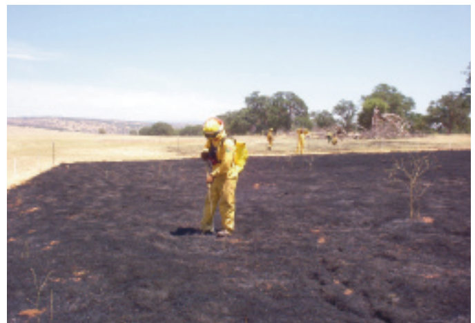
Mop-up activities take place after a burn. Care is taken to make sure hot spots of smoldering fuel won't flare up.

Many agencies can be involved in the review of a proposed project. These typically include the US Fish and Wildlife Service, US Environmental Protection Agency, state Fish and Game agencies, Water Quality Control Boards, Air Quality Management Districts, advocates for threatened and endangered species, archaeological and historical organizations, Native American cultural groups, and various proponents and opponents of prescribed