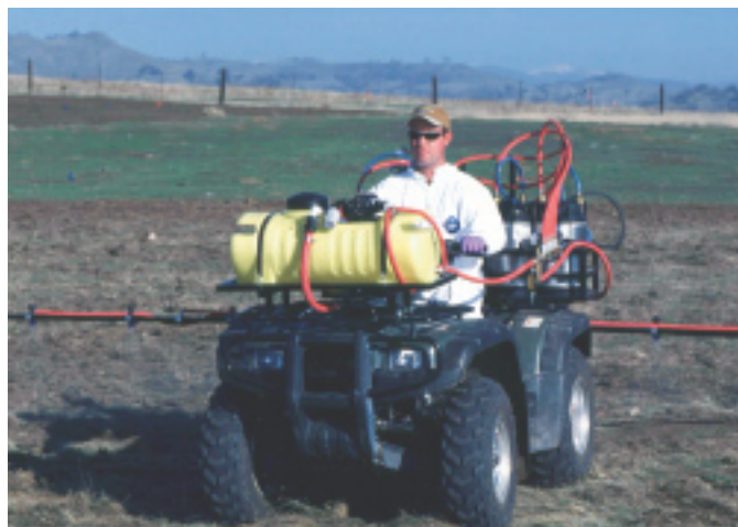
Prescribed burns can enhance effectiveness of herbicides. Pre-emergent herbicides can be more effectively applied to soil when thatch has been burned. Here an ATV-mounted boom sprayer applies imazapic following a summer burn for control of medusahead ( Taeniatherum caput-medusae ). The burn not only prevented new seed recruitment, but it cleared the ground for chemical treatment. Flemming Ranch, Fresno County, CA.

Similar results have occurred with the stimulation of native legumes and perennial grasses in burns