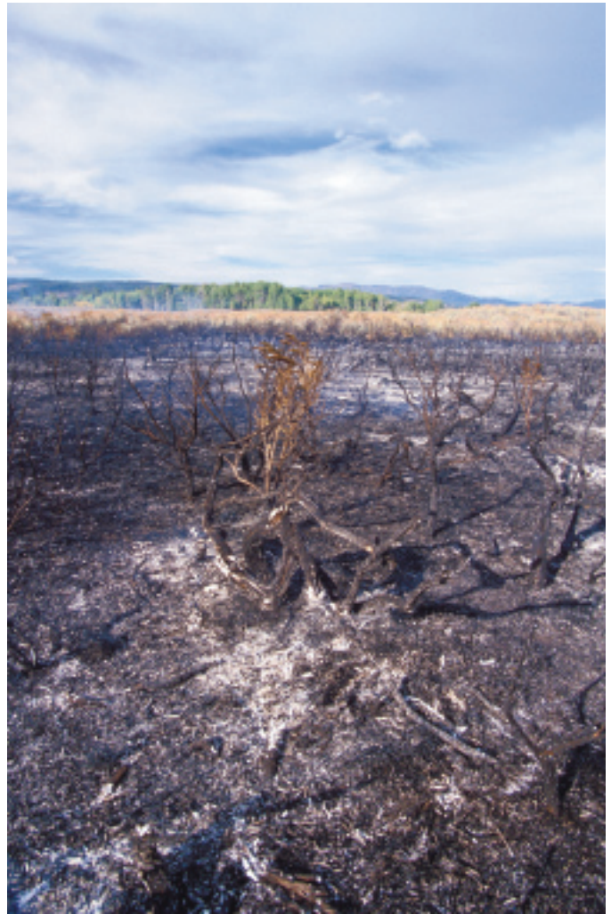
Fire affects all components of soil. Chemical, biological and physical properties are all altered from heat and oxidation of fuels. Henninger Ranch, U.S. Sheep Experiment Station, Kilgore, ID.

In contrast to N, both potassium (K) and phosphorus (P) require >700 °C for volatilization and their loss is usually minimal unless the fire is followed by erosion. Other nutrients such as calcium (Ca), magnesium (Mg), and sodium (Na) require much higher temperatures for volatilization. These other nutrients showed either increases or decreases depending upon the type of ion (Tables 3, 4).