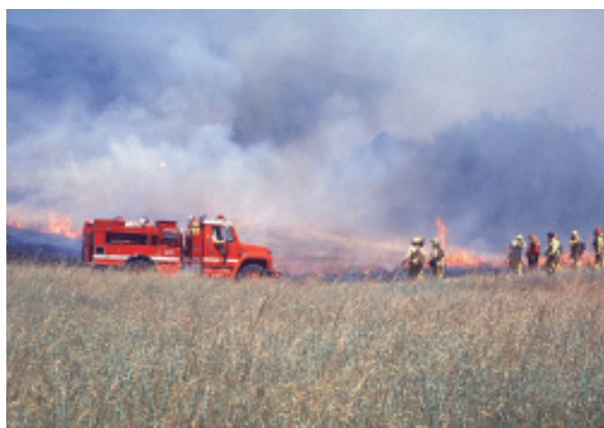
Agencies coordinate leadership responsibilities for prescribed burns. On this burn to control yellow starthistle at Sugarloaf Ridge State Park, personnel from State Parks and the California Department of Forestry and Fire Protection coordinated team activities including preparation of fire lines, equipment crews, and burners and beaters. Sonoma County, California, early July, 1995.

The third responsibility is the designation of a qualified fire manager to execute the project. The duties of the prescribed fire manager include ensuring that resources are available, determining that fuel and weather conditions are within the parameters of the burn prescription, informing regulatory agencies and media of the burn, managing the activity and