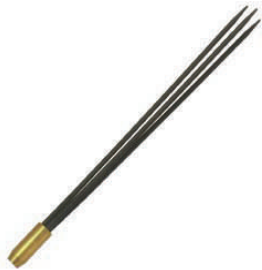
Paralyzer-tip for pole spears.