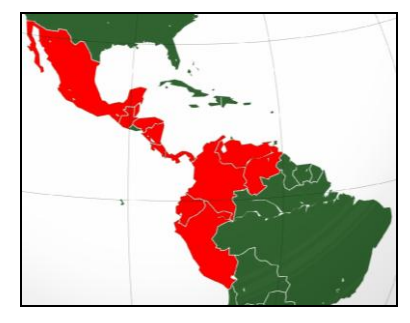
Figure 1. Distribution of frosty pod rot (infected areas shown in red).

Frosty pod rot has been reported in South America {Ecuador, Colombia (1817), Peru (1950), Western Venezuela (1941)} and Central America (Costa Rica, Nicaragua, Panama, Honduras, Guatemala, Belize and Mexico).