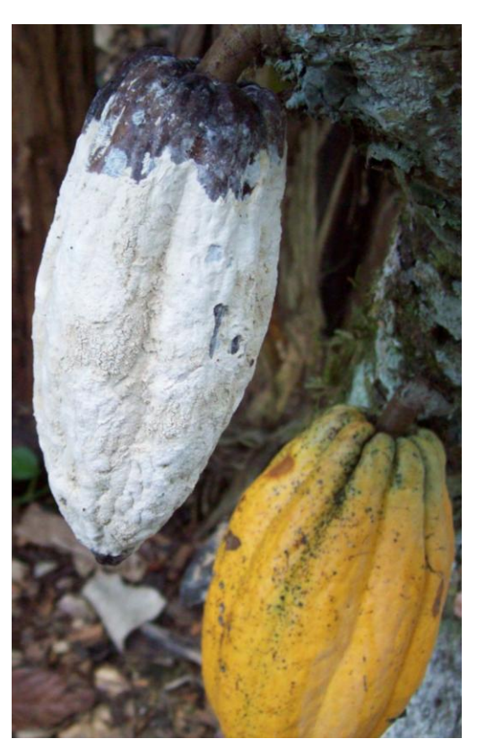
Frosty Pod Rot on Cocoa